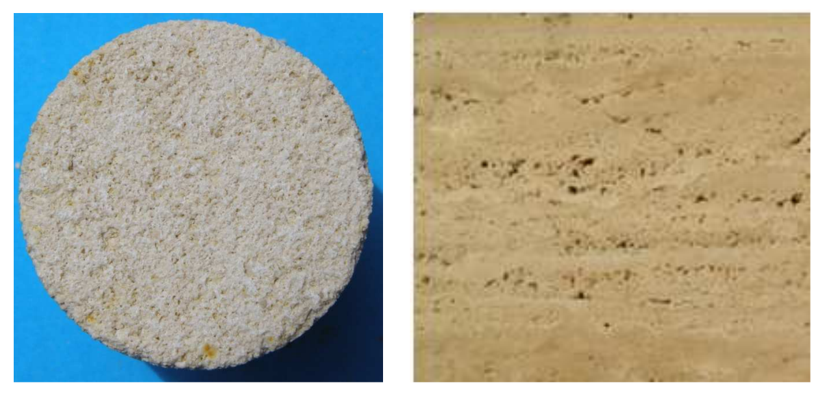
Fig. 2 Miocene porous oolitic limestone