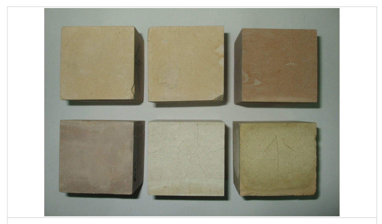
Fig. 4 Discolouration of Globigerina limestone Samples from top left to right, bottom left to right: yellow 100°C; yellow 200°C; reddish-brown 400°; grey 600°C; white 800°C; grey-white 1000°C