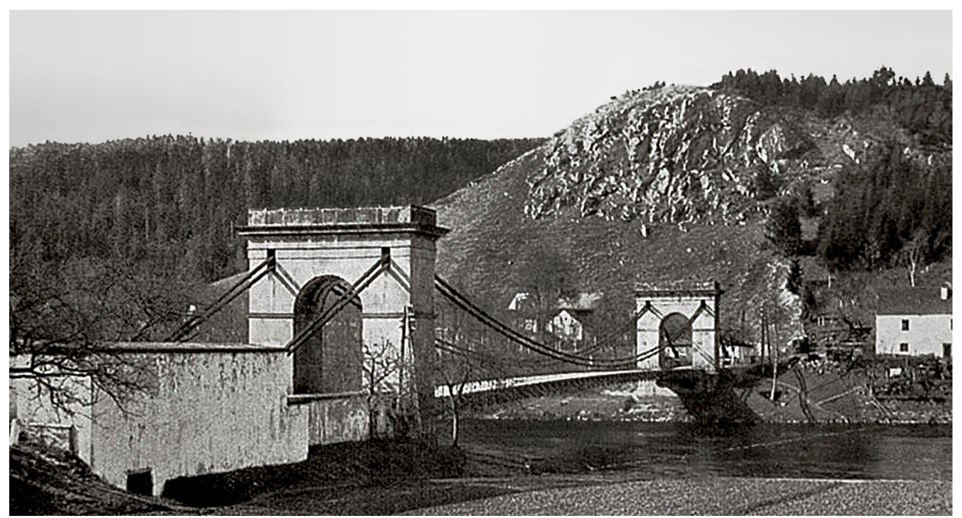
Original position of the bridge in Podolsko

Today the bridge is used by pedestrians and, with limited access, by vehicles.