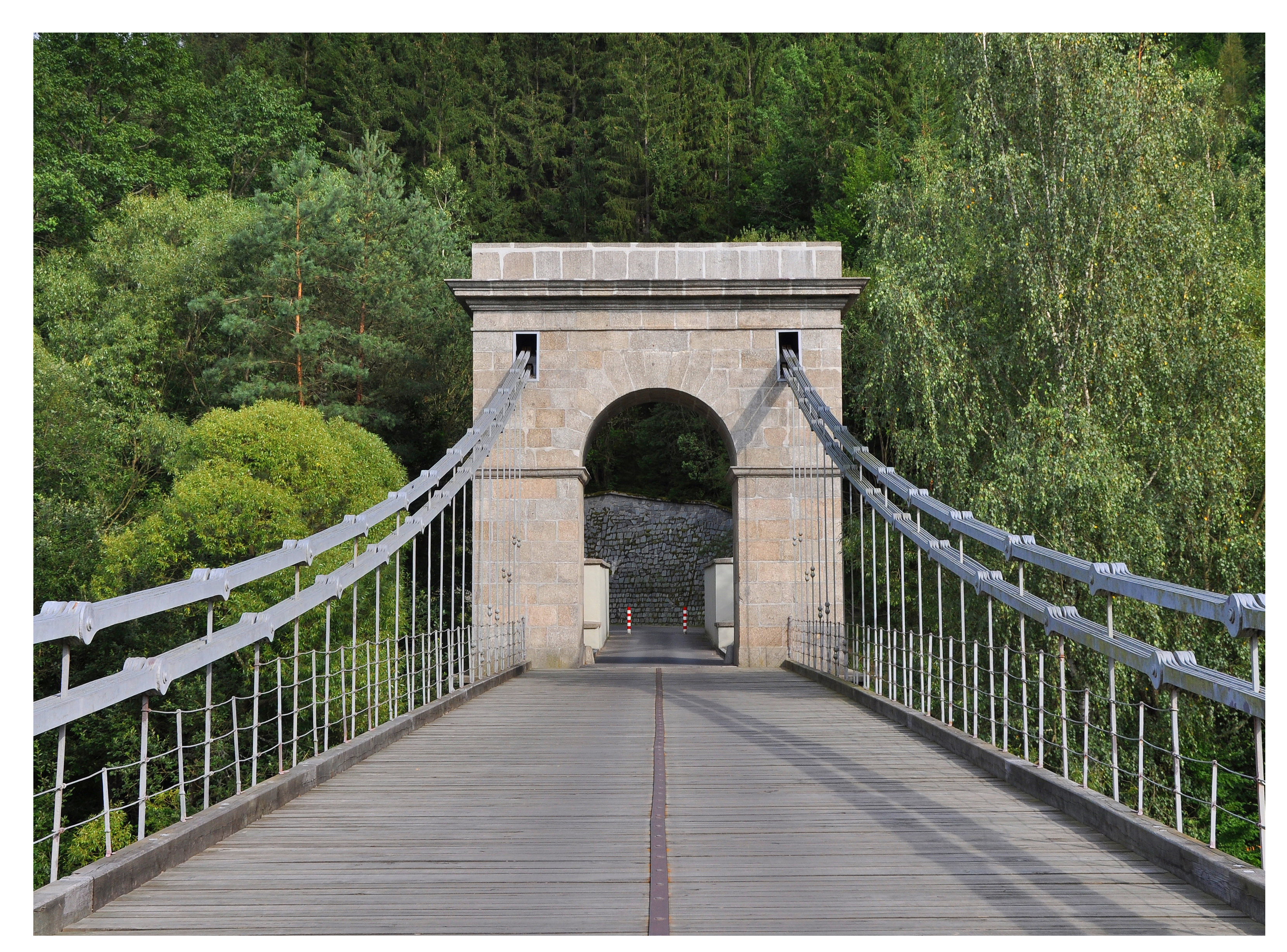
View of the bridge deck, chains and pylon in 2019

The bridge has been preserved in its original dimensions and mass, which was a requirement of the conservationists.