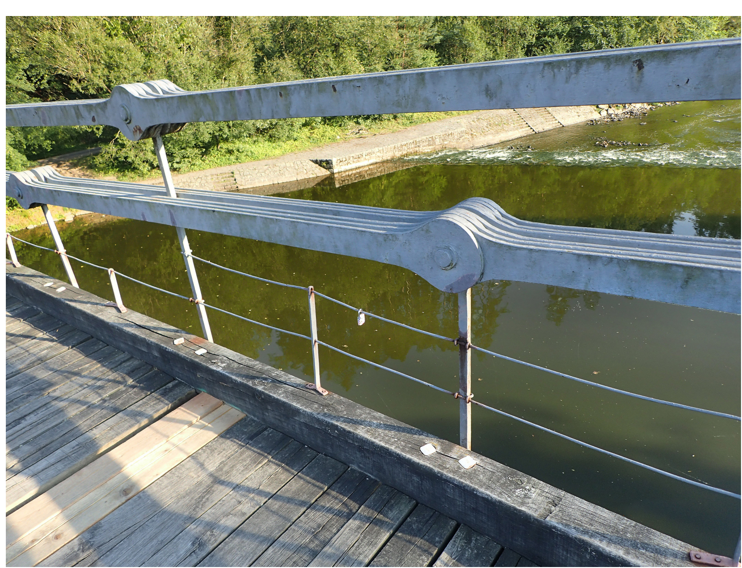
View of the chains forming the main support system

It is a single-span chain suspension bridge with a lower suspension bridge deck, and the perpendicular clearance of the span is 86.26 m. The basic supporting structure is represented by four main wrought steel chains arranged in two pairs above each other. The chain consists of six links of 3,15 m in length, the connecting pins are 53 mm long, and the end pin 105 mm long. The chains are mounted on two stone pylons measuring 3,5 m × 9 m with an opening of 3,82 m and a height of 15,08 m and 16,26 m respectively. The pylons are made of stone blocks, filled with concrete and founded on piles 35 cm in diameter. The ends of the chains are anchored to the pins embedded in the hooks of eight iron anchor plates, each weighing 2.3 tonnes. The carriageway is made up of wooden bridges 16 cm high, and the railings are made of 1 m high steel. The load bearing capacity of the bridge was designed as normal – 0.85 t, exclusive – 5.08 t and exceptional – 9.24 t.