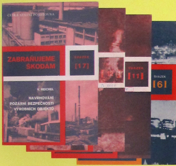
The first introduction into structural fire design, Reichel V.: Fire design of industrial structures, ČSP, vol. 17, Prague 1987.